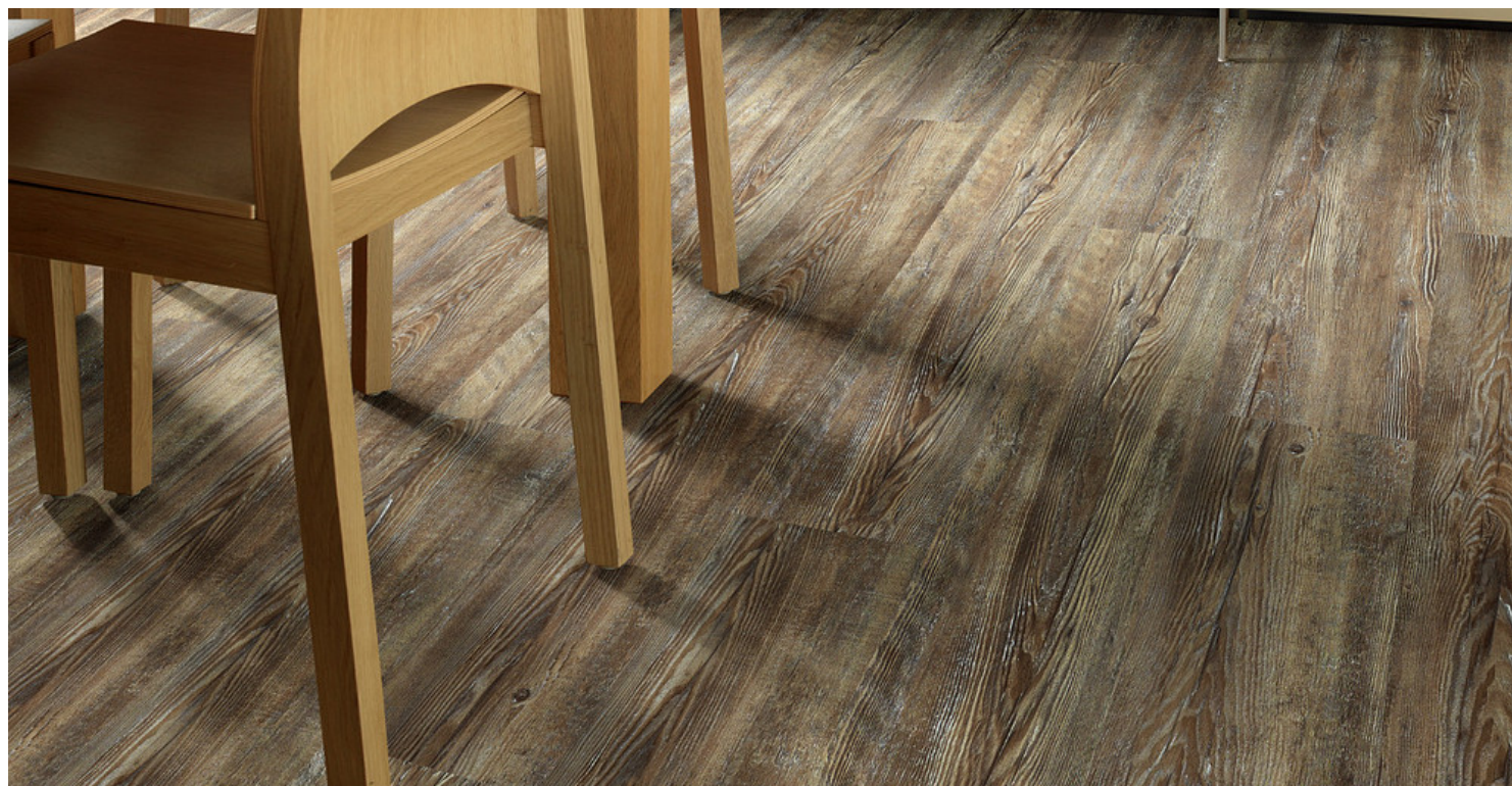
717 Tattered Barnboard